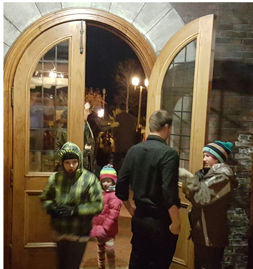
Members and guests attended the Kitchi Gammi Club Christmas City of the North Parade Viewing Party on Nov. 20. It was wonderful to see the bright future of the Club on display as people of all ages entered the festive Clubhouse!