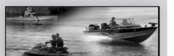
M.D. stressing summer safety on the water

June's Bird of the Month is the golden-winged warbler. This songbird actually benefited from widespread clear-cutting in the 1800s and early 1900s.