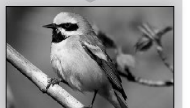
Wisconsin's golden-winged warbler belted

June's Bird of the Month is the golden-winged warbler. This songbird actually benefited from widespread clear-cutting in the 1800s and early 1900s.