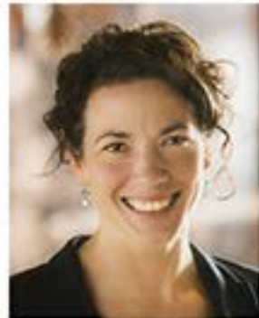
Emily Larson City of Duluth's first female mayor